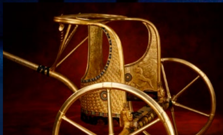
TUTANKHAMUN'S CHARIOT A KING APPEARS AS THE SUN

The lavishly decorated chariot is unsuitable for battle and probably served as Tutankhamun's state coach. The shining gilding and the sun hawk on the shaft indicate that the King appeared in it as the sun god incarnated on earth.