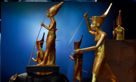
FIGURES OF GODS AND THE KING RITUAL HELPERS FOR THE AFTERLIFE

The mysterious and beautifully gilded figures of gods and the King probably served ritual purposes at the resurrection of the dead King in the afterlife. They were found wrapped in linen in the treasury in small black boxes.