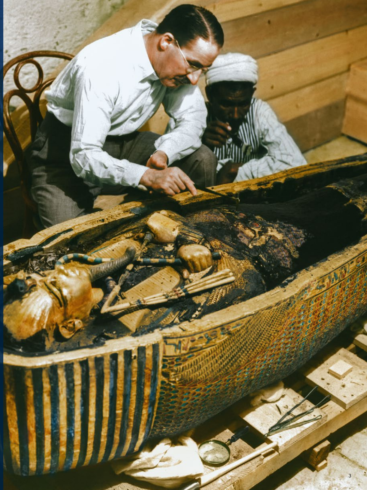
Howard Carter and an Egyptian workman with Tutankhamun's third (innermost) coffin.

The enormous audience and media interest in the history of King Tut and the widespread fascination for ancient Egyptian culture is as vital as ever.